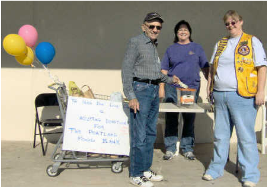
The Portland North Bay Lions Club held a Care & Share Food Drive for the local Salvation Army-Portland Food Bank; members collected $155 cash donations and over 255 pounds of food